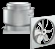
Fans and Ventilators