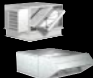
Energy Recovery Ventilators & Make-Up Air Units