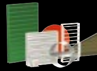
Dampers and Louvers

Visit the Greenheck website for the most current information available www.greenheck.com