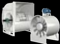
Centrifugal and Vane Axial Fans